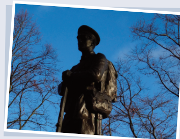
Heath Town Park