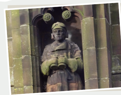
Servicemen Memorial Airman