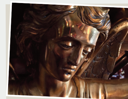
Bantock Park Museum